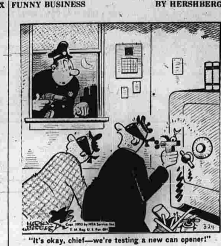
TOONERVILLE FOLKS BY FONTAINE FOX FUNNY BUSINESS BY HERBSBERGER CARNIVAL BY DICK TURNER