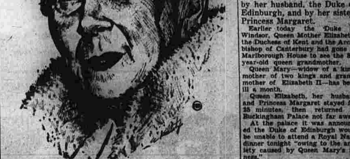
This is the Dowager Queen Mary that the public has seen, wearing one of the toques-style hats in which she chafed through most of her lifetime.

London, March 24.—(AP)—A bulletin on Queen Mary's illness, issued tonight, said: "Queen Mary's strength is ebbing but Her Majesty is sleeping peacefully."