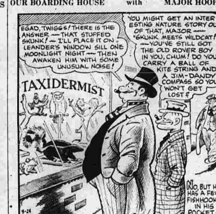
OUR BOARDING HOUSE with MAJOR HOOPLE