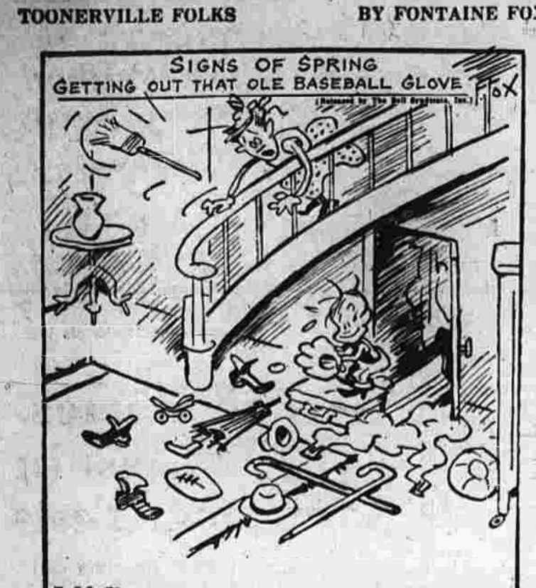
TOONERVILLE FOLKS BY FONTAINE FOX FUNNY BUSINESS BY HERBSBERGER CARNIVAL BY DICK TURNER